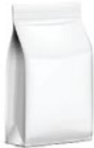
Flat Bottom Bags