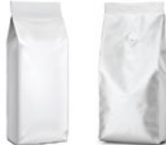
Side Gusset Bags