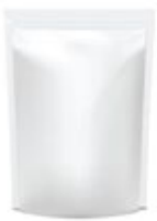
Stand Up Pouches