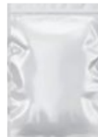
Three Side Seal